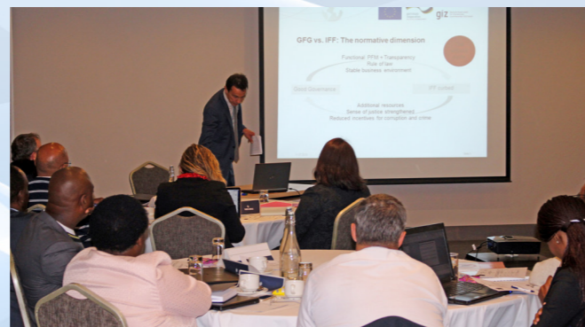
GIZ brought together partner networks and development partners during a workshop on IFFs held in Pretoria in 2016.