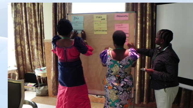
Participants of the Women Leadership Academy are discussing different dimensions of leadership at the launch workshop in Gabon in February 2016.

Research on budget processes and legislative oversight in African countries, initiated by the programme, lays the foundation for peer learning processes and country-specific measures. In 2016, GIZ published an overview study that compared thirteen Anglophone and thirteen Francophone African countries with respect to parliamentary budget supervision. The publication summarises contrasting institutional traditions, settings and experiences, and highlights common and distinctive strengths and weaknesses in each group.