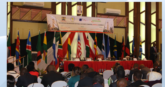
GIZ supported the August 2016 AFROPAC general meeting and conference on how to fight IFFs and increase accountability of governments. It was held in Nairobi.